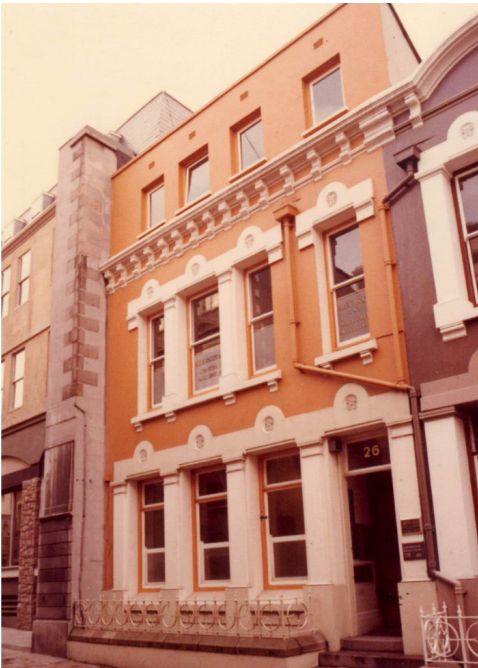
■ The firm moved to 26 Hill Street in 1901

Honouring 140 years of dedicated service to clients, we look forward to continuing this trusted relationship for generations to come.